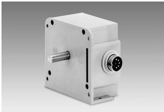
G 305 with single shaft